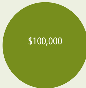
Lincoln New Directions 6 Fixed Account at 2.00%